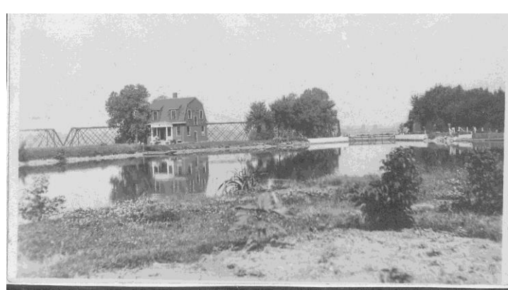
De Pere Lockmaster's House

Each lock in the navigational system was operated and maintained year-round by a lockmaster. Because the system operated day and night, homes for the lockmaster and his family were built near the locks to provide 24-hour service to the boats traveling up and down the river. The lockmaster and his helpers opened and closed the lock gates and