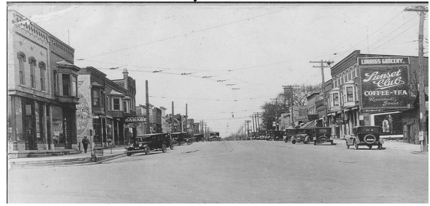
Trivia answers: 1 – 1634; 2 - Morrison Hill 1020 ft.; 3 - Watertown; 4 - Main Street looking west

Newsletter Sponsored by: Starry Realty 112 N Broadway, De Pere